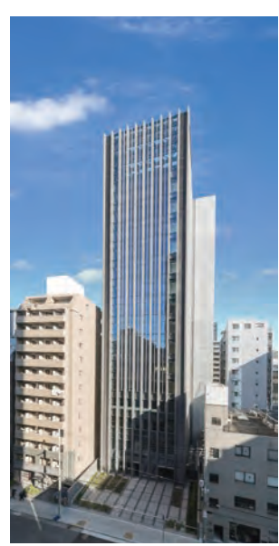
Promoted energy-saving initiatives, including switching to LED lighting at each workplace

Capcom has worked to cut power usage through efforts that include ongoing power saving at all of its places of business, saving energy at its amusement facilities, and implementing peak shifting for the power used by PCs and other electrical equipment. The fiscal year ended March 2017 saw our CO<sub>2</sub> emissions increase compared to the previous fiscal year due to the construction of the R&D Building #2 and Capcom Technical Center. However, in the fiscal year ended March 2021, we succeeded in reducing emissions by 9.5% compared to the previous year by introducing energy-saving equipment at those facilities and promoting the switch to LED lighting at each workplace.