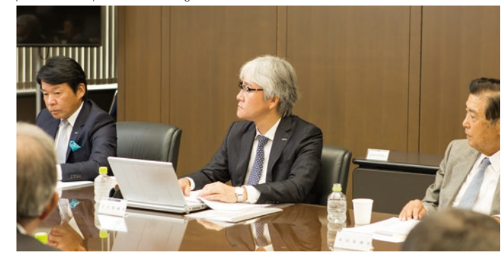
Positioned between the development workplace and senior management to better communicate the ideas and contentions of both.