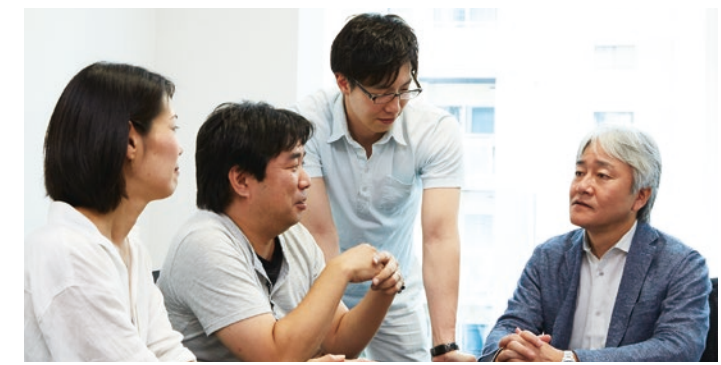
Proactively listening to the opinions of young team members. Occasionally, heated debates about production take place over meals together.

At present, he is in charge of Consumer Games Development and Amusement Equipments Business.