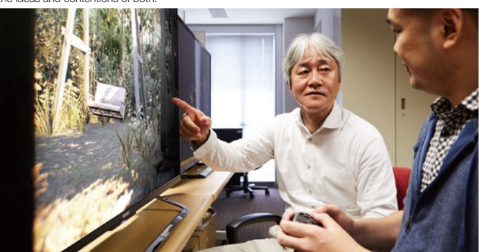
Visiting the workplace to understand actual development conditions. Seeing things from a different perspective than immediate supervisors raises awareness of potential issues.